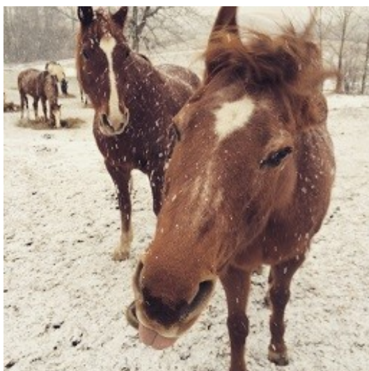
Miss Scarlett catching snowflakes last winter!