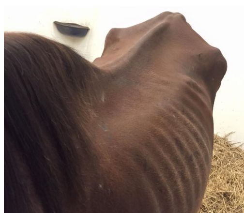
Gale at intake on 8/12/15