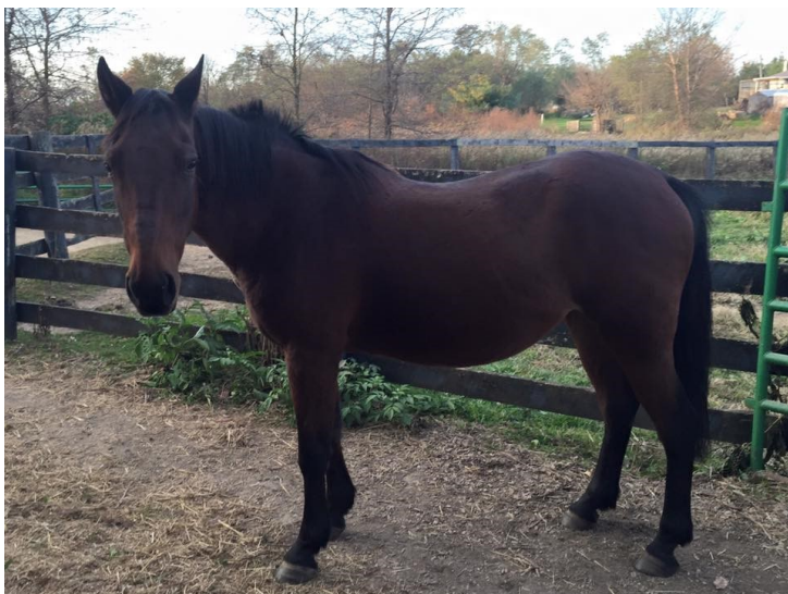
Gale after putting on approximately 200 lbs. in 3 months with us!