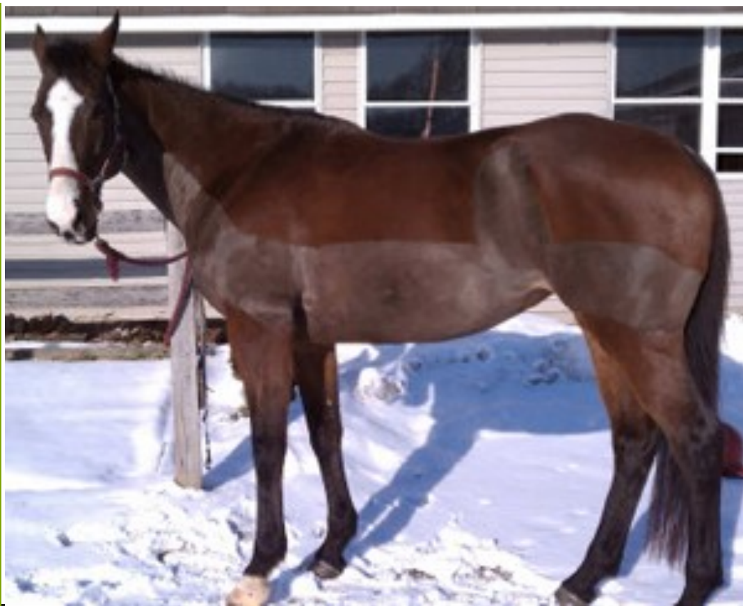
Trace clipping pattern.

The biggest challenge is cooling down your horse afterwards. It can be very dangerous to a horse to be placed in a cold stall after becoming sweaty during winter exercise without a cooler on to wick away the moisture to speed drying time and prevent a chill during the cool down. You may consider doing a Trace clip (see picture) to keep the hair coat trimmed which will also reduce cool down time. Keep in mind that horses that are clipped will require more feed to accommodate increasing energy to keep warm and blankets and shelter will be needed until the spring warm up. Also by blanketing you are disrupting the growth of the hair coat and it may take years, if ever, to recover back to its natural thickness.